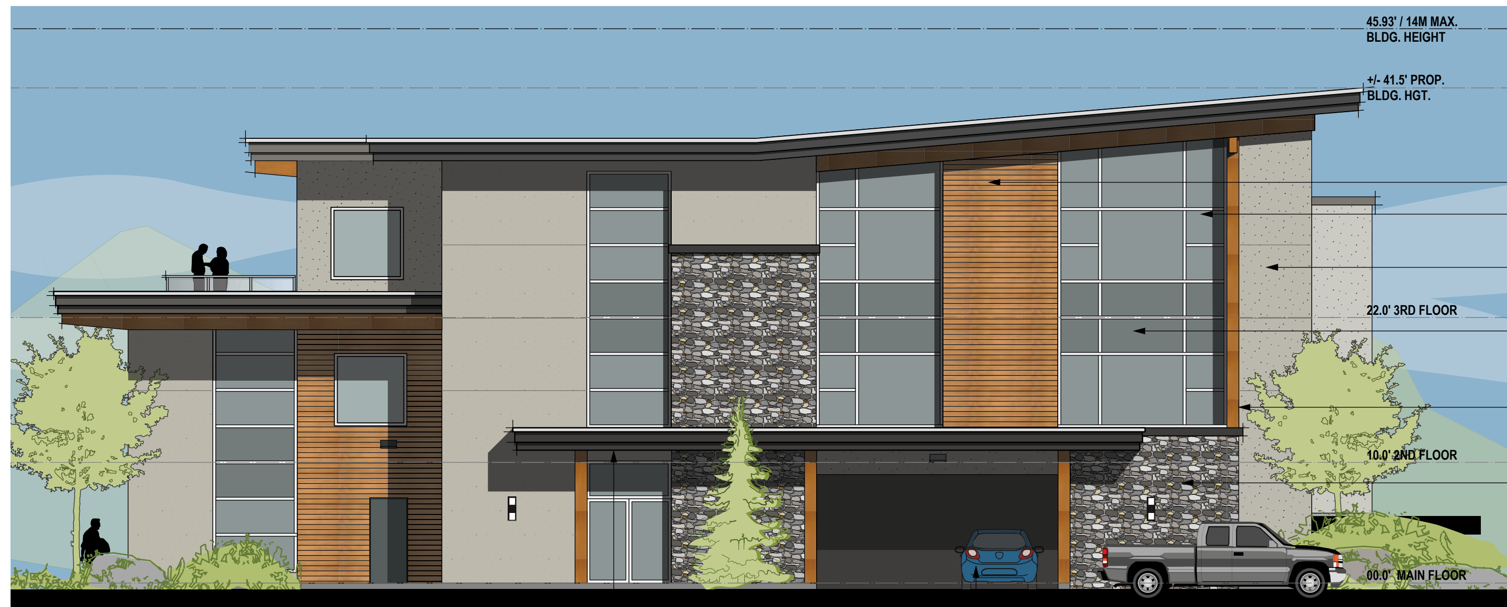
NORTH ELEVATION - FACING PARKING AREA