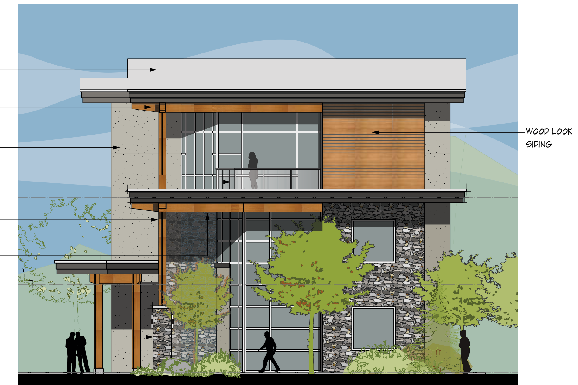
SOUTH ELEVATION - FACING NORTHFIELD