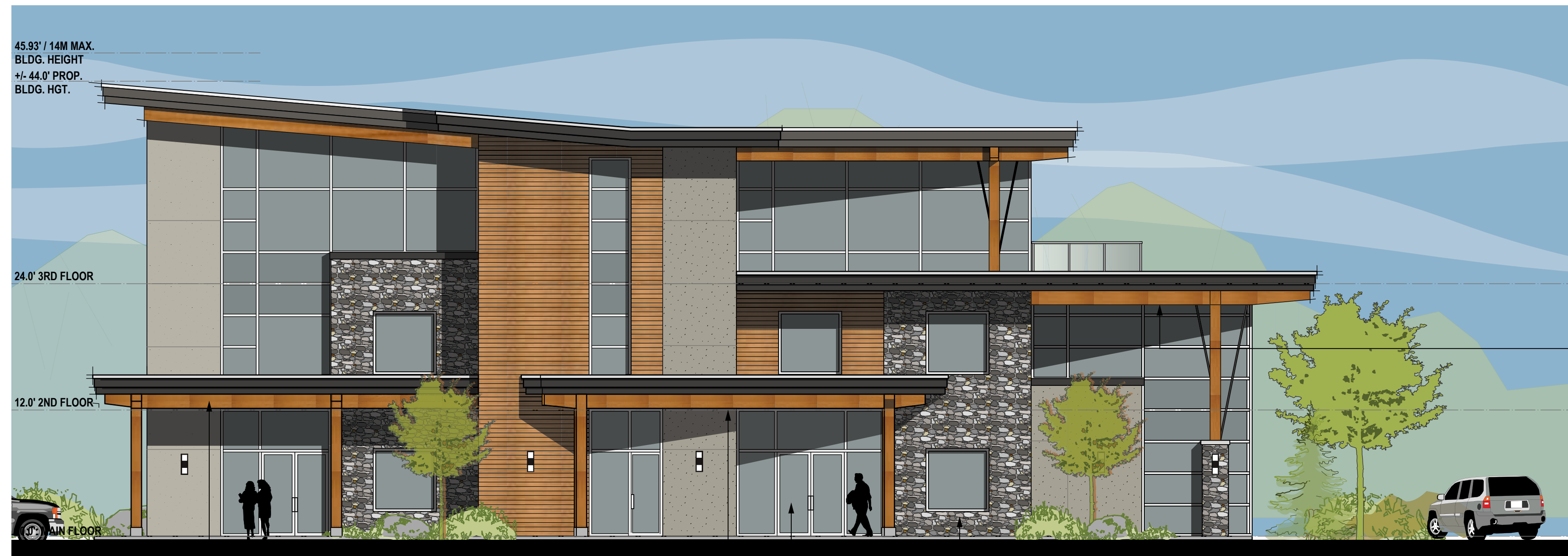
WEST ELEVATION - FACING PARKING AREA